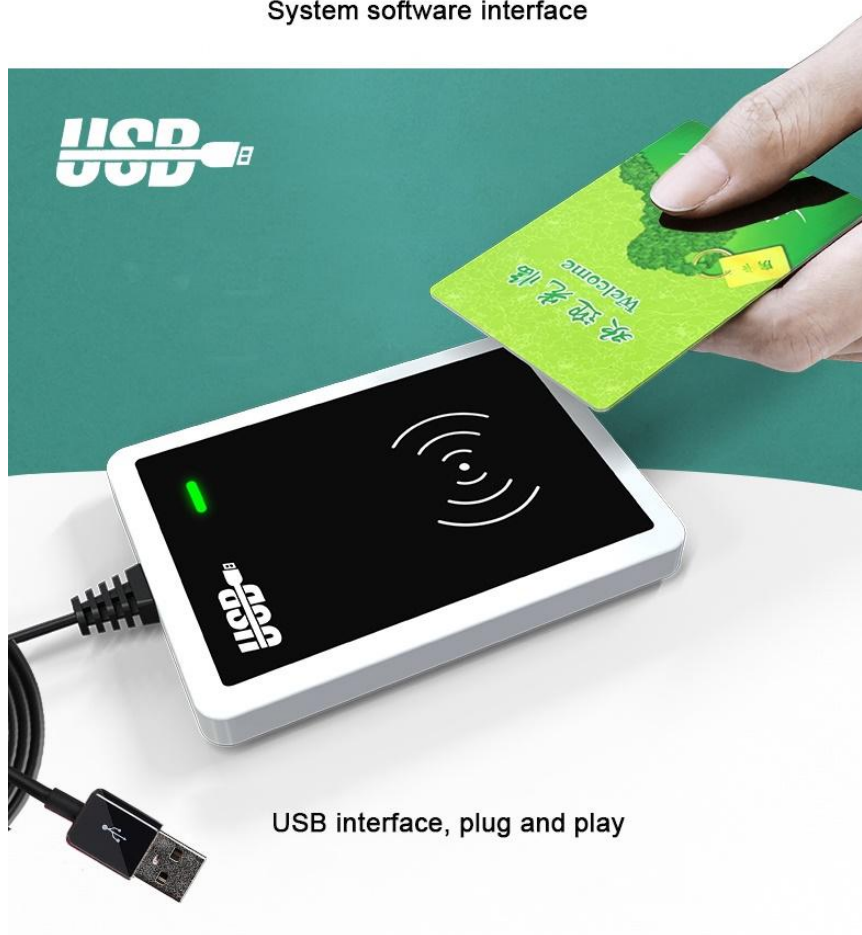
USB interface, plug and play